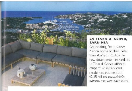
LA TIARA DI CERVO, SARDINIA Overlooking Porto Cervo Marina home to the Costa Smeralda Yacht Club, is this new development in Sardinia. La Tiara di Cervo offers a range of 28 exceptional residences, costing from €2.35 million. www.villasardinia.com realstate.com; 029 3823 6544

‘The properties themselves promise to be as special as the surroundings, ranging from one-bedroom apartments to penthouses with private pools’