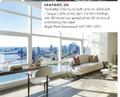
SEAPORT, US Manhattan is famously built upon an island and Seaport reflects the city’s maritime heritage, with 80 residences spread across 60 storeys, all overlooking the water. Knight Frank International ; 020 7861 5033